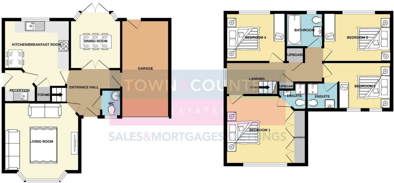
1ST FLOOR 649 sq.ft. (60.3 sq.m.) approx.

TOTAL FLOOR AREA: 1310 sq.ft. (121.7 sq.m.) approx.